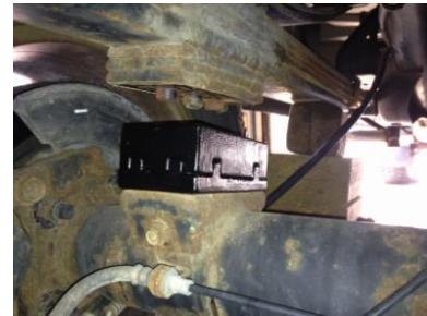
2.0" REAR LIFT OPTION