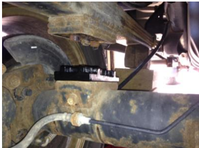
1.0" REAR LIFT OPTION

Step 7: Determine whether you want a 1.0", 1.5" or 2.0" rear lift, and orient the components according to the images shown below to achieve your desired right height. If installing in the 2.0" configuration, be sure that the indicia stamped FRONT on BOTH interlocking blocks is positioned toward the FRONT of the vehicle. (Figure E, below)