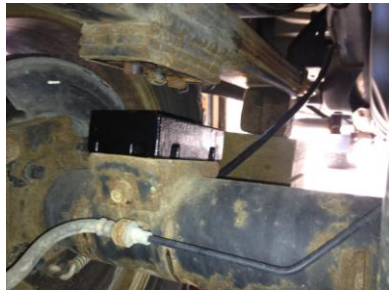
1.5" REAR LIFT OPTION