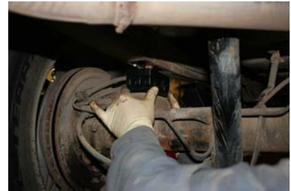
2.0" REAR LIFT OPTION

IMPORTANT! THIS IS A PATENT PENDING, INTERLOCKING SYSTEM AND SHOULD NEVER BE STACKED OR USED WITH ANY OTHER LEAF SPRING BLOCKS AS IT MAY CAUSE AN UNSAFE CONDITION FOR BOTH THE INSTALLER & THE VEHICLE DRIVER.