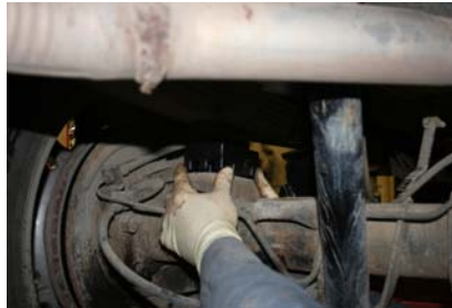
1.5" REAR LIFT OPTION