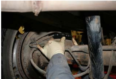
1.0" REAR LIFT OPTION

Step 5: Determine whether you want a 1.0", 1.5" or 2.0" rear lift, and orient the components according to the images shown below to achieve your desired right height.