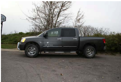
Vehicle BEFORE Installation