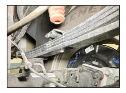
STEP 6: Install tapered lift block with 'FRONT' marking towards front of vehicle.