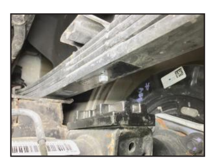
STEP 8: Install lift block, 1.5" height shown.